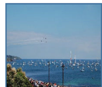
Red Arrows over the bay