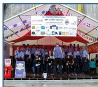
Sea Shanty Festival

Alongside all the above the FBRA Garden Fete is scheduled to take place at the Princess Pavilion on Saturday 3 rd September. A little earlier, the second season of Zestifal will be between 23 rd to 27 th July with free activities for all. Later, towards the end of the year no doubt, the Santa Fun Run will return alongside the excellent range of Christmas activities co-ordinated by the town.