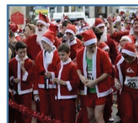
Santa Fun Run gears up