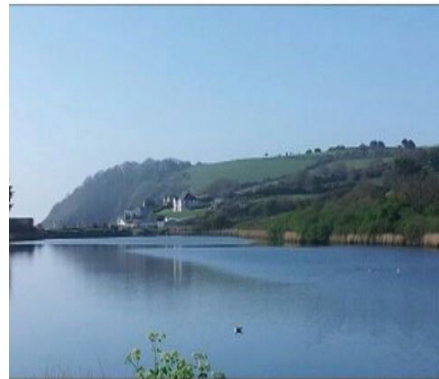
Beautiful Swanpool ▲