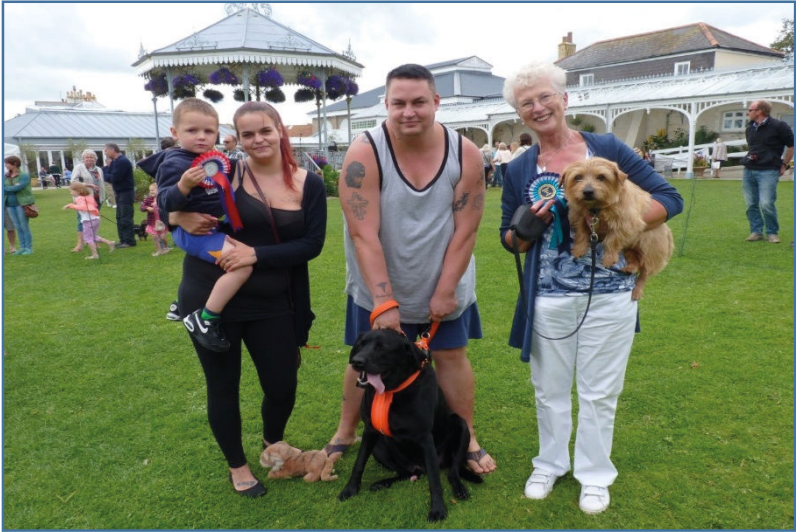
Best in Show, Jupiter, and runner up, Sandy, with their owners